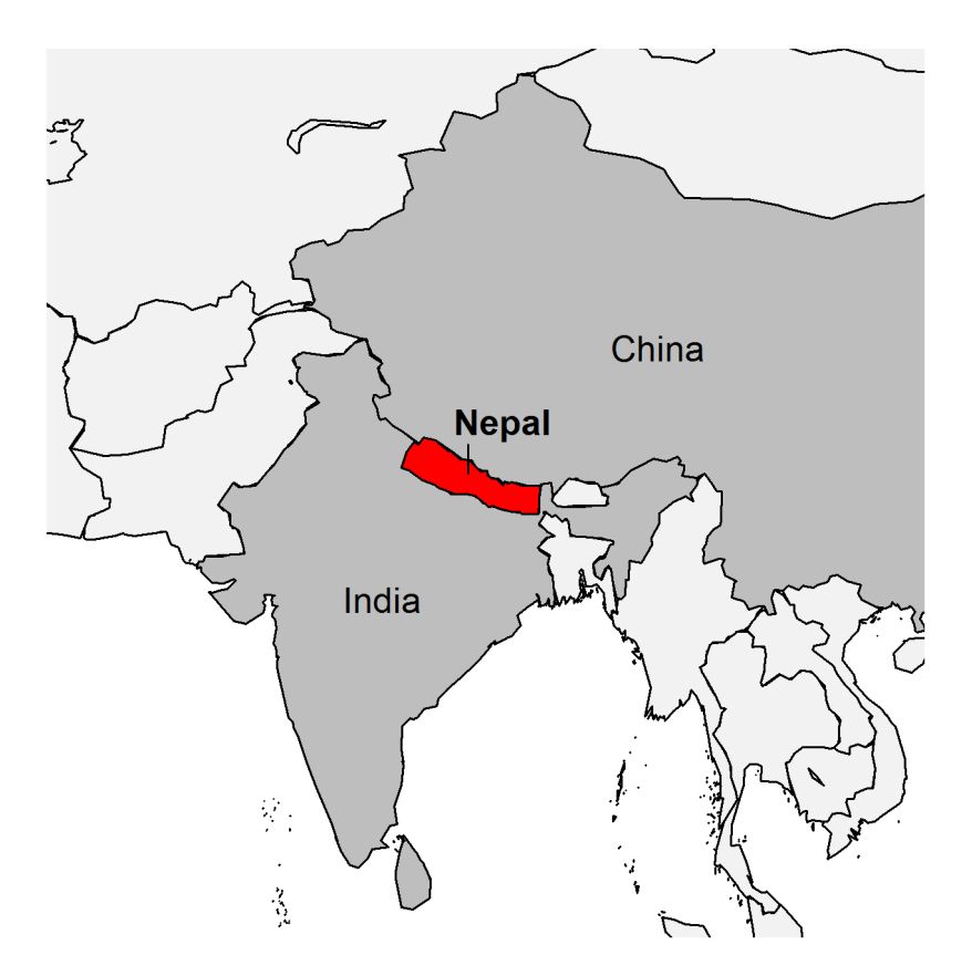
Figure 1. Nepal, in red, bordered by India in the south, and China in the north. doi:10.1371/journal.pntd.0002634.g001